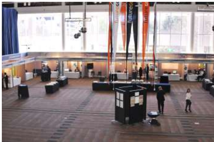
The Australian Pavilion at FutureGov Congress Australia.

In September 2011, the Australian eGovernment Technology Cluster with the help of the Canberra Convention Bureau partnered with Alphabet Media to bring FutureGov to Australia.